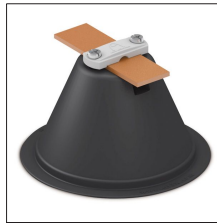
AT-041E Conical roof conductor holder (empty)