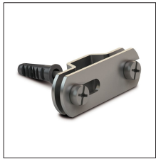
AT-240E St. steel buckle clip for tape to wall