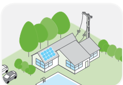
Residential backup power