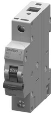
SINOVA, Miniature Circuit Breaker 240/415V 6kA, 1-pole C, 20 A