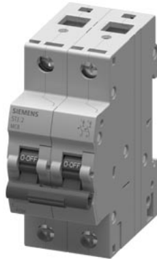
SINOVA, Miniature Circuit Breaker 415V 6kA, 2-pole C, 63 A