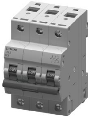
SINOVA, Miniature Circuit Breaker 415V 6kA, 3-pole C, 32 A