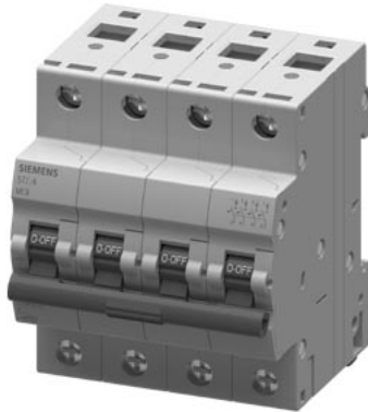
SINOVA, Miniature Circuit Breaker 415V 6kA, 4-pole C, 63 A