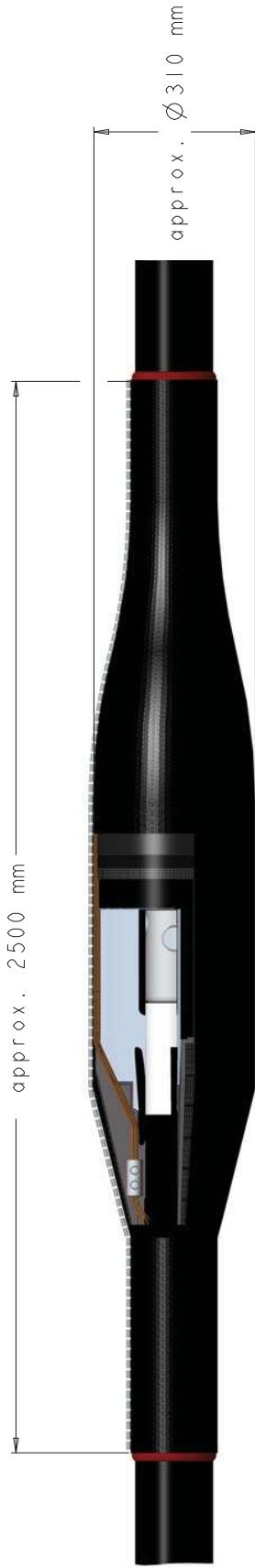
INLINE 245 kV

While TE Connectivity (TE) has made every reasonable effort to ensure the accuracy of the information in the catalog, TE does not guarantee that it is error free, nor does TE make any other representation, warranty or guarantee that information is accurate, correct, reliable or current. TE reserves the right to make any adjustments to the information contained herein at any time without notice. TE expressly disclaims all implied warranties regarding the information contained herein, including, but not limited to, any implied warranties of merchantability or fitness for a particular purpose. The dimensions in this catalog are for reference purpose only and are subject to change without notice. Specifications are subject to change without notice. Consult TE for the latest dimensions and design specifications.