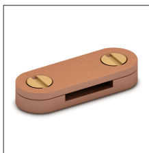
AT-100E 20 x 3mm gunmetal DC tape clip