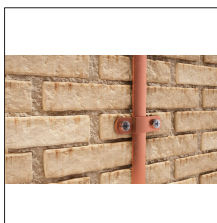
AT-123E Grapa simple de Cu para pletina 25x3mm