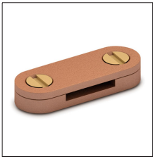
AT-114E 25x3mm gunmetal DC PVC covered tape clip