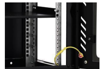
Zinc plated mounting profile (Ground wire optional)