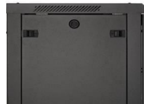
Removable side panels (Side lock optional)