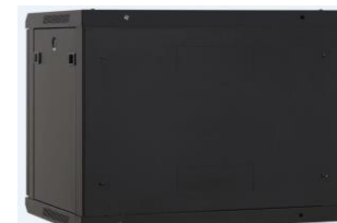
Cable entrance on rear panel