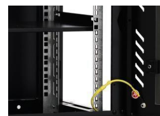
Zinc plated mounting profile (Ground wire optional)