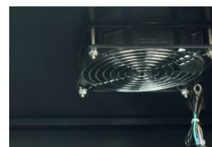
Fan unit optional