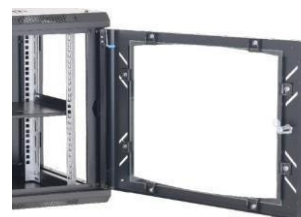
Front tempered glass door with metal perforated border