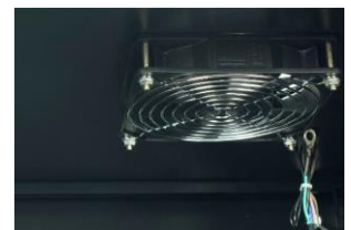
Fan unit optional