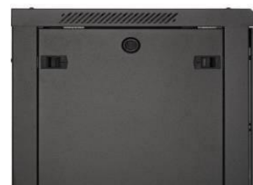
Removable side panels (Side lock optional)