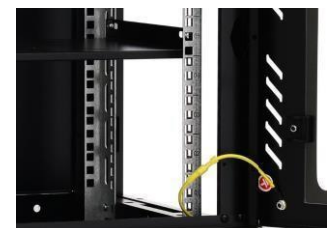
Zinc plated mounting profile (Ground wire optional)