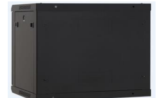
Cable entrance on rear panel